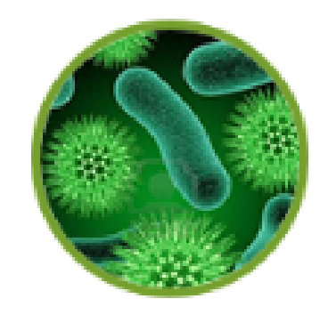
Microbiological Screening Services