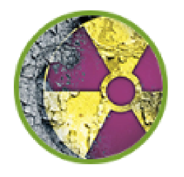
Radiological Testing Services