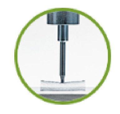
Medical Devices Testing Services